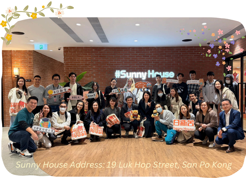
Sunny House Address: 19 Luk Hop Street, San Po Kong